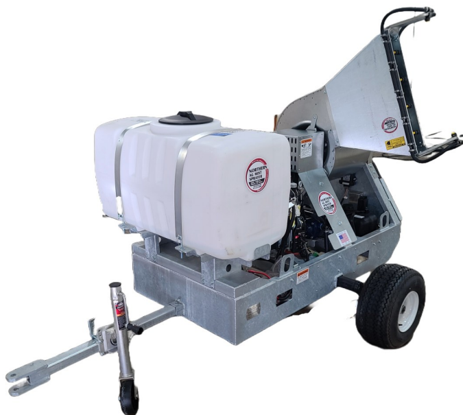
TPT-50 with optional Orchard Volute and Tow Package